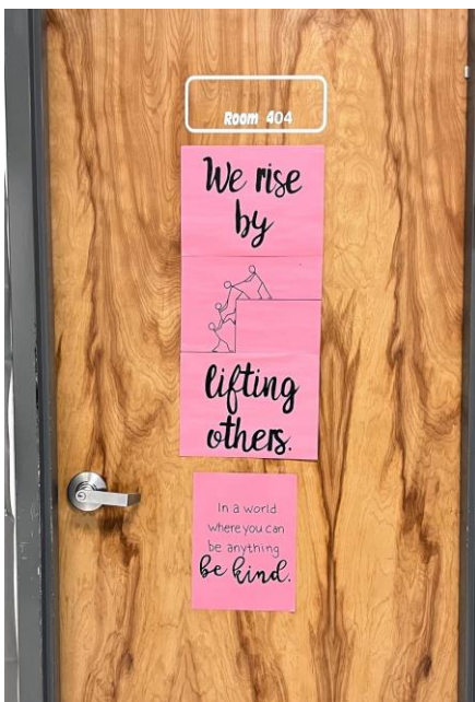
Your WJ Mouat Admin Team

The Aspire team got quite inspired by the amazing job the dedicated and talented Leadership students did this week while celebrating our wonderfully diverse school.