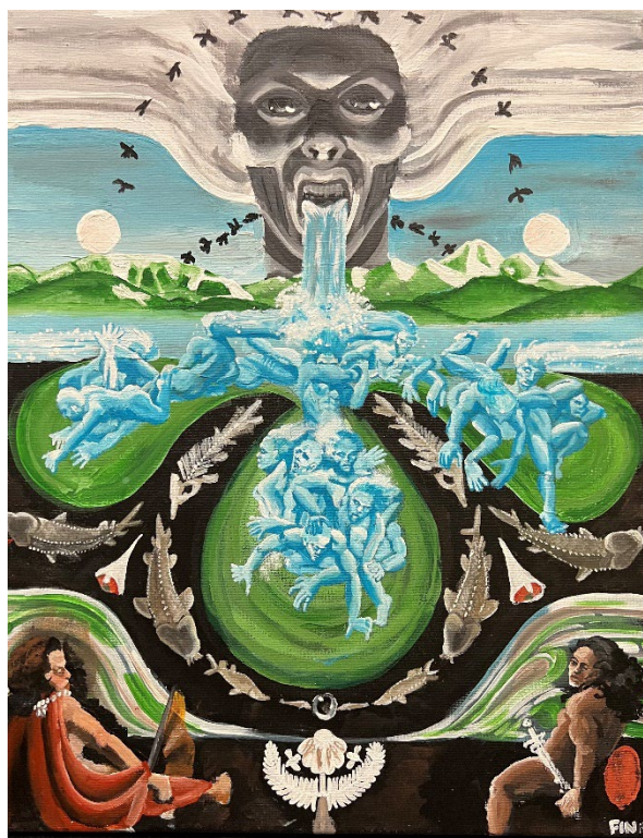
Finn Toews (Gr 12) won third place in the grade 8-12 Visual Art Category