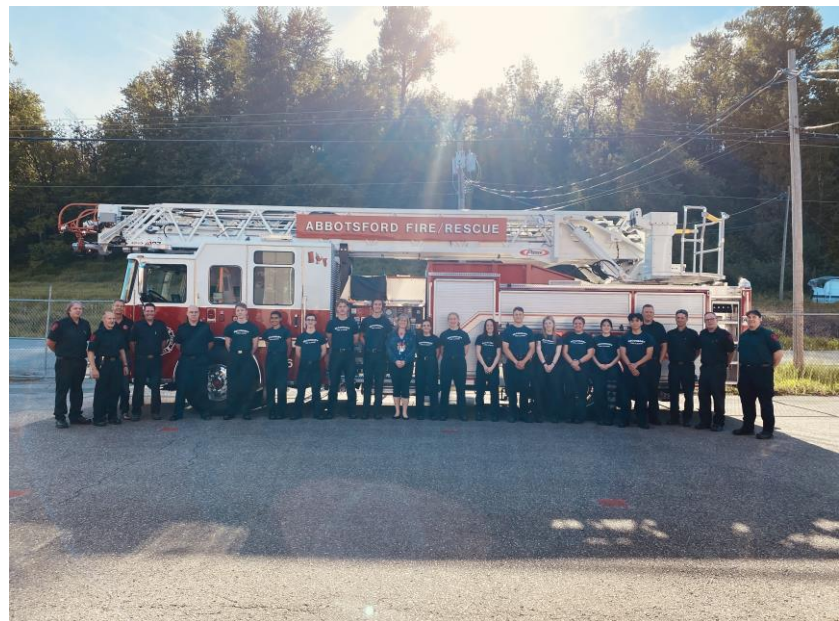
Your WJ Mouat Admin Team